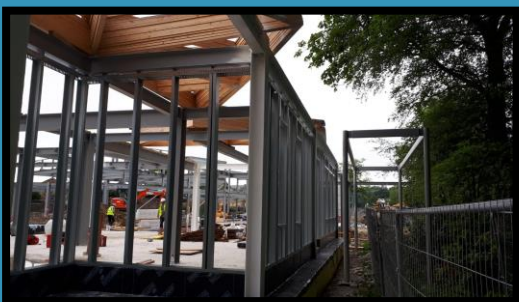
John Turner Construction – Birtenshaw School, Bolton

“Become the sub-contractor of choice for our clients through a combination of competitive pricing and excellent customer service.”