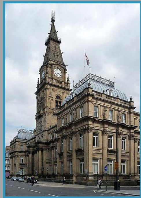
Municipal Buildings – Russells WBHO

The company turnover for the last financial year was circa £4,000,000 and we are looking to increase this for the next financial year.