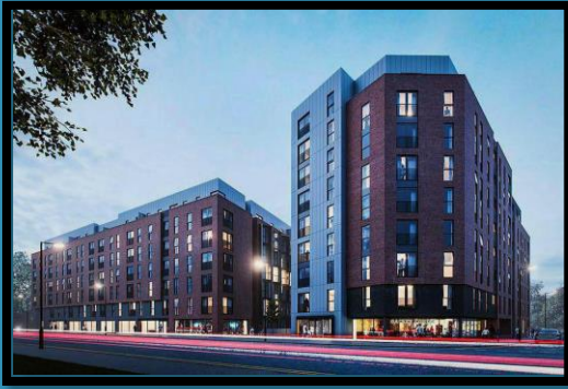
Merchant's Wharf – Legacie Developments